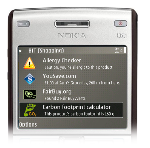
Fig. 2. Browser aggregation perspective showing overview of information and services available for a tagged object.

Applets. Services and information regarding a physical product are provided through applets , i.e., small programs that are executed within BIT. The functionality offered by an applet can range from the very simple task of displaying some information on a physical object to more complex procedures, such as gathering user input and communicating with a physical appliance.