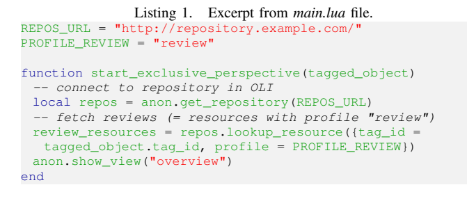
Listing 2. Corresponding view overview. <view title = 'ReviewCentral.com'</pre> <list><? reviews = {} for i = 1, #review_resources do reviews[i] = anon.json_decode( review_resources[i].data.value) anon.out('<list_item description="Rated ' ...</pre> out of 5">') reviews[i].rating ... ' anon.out(reviews[i].title) anon.out('</list_item>') end ?> <menu><menu_item action="anon.show_view('details', {review = reviews[index]})">Show details</menu_item> </menu></list> </view>

<sup>5</sup>This ensures that the output produced by other applets is available immediately when the user switches from exclusive to aggregation perspective.