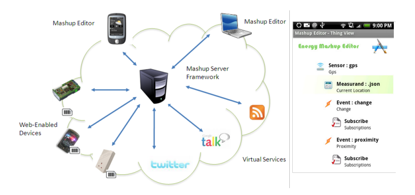
Fig. 2. Architecture of the physical mashup framework and screen-shot of a mobile mashup editor.

easily access RESTful services. Thus, it is straightforward to create Clickscript building blocks representing smart things. We used this approach to create building blocks for all the sensors and actuators of the Ploggs' and Sun SPOTs' RESTful APIs. As an example, we created a mashup shown in Figure 1. This mashup gets the room temperature by GETting the temperature resource of a RESTful Sun SPOT. If it is smaller than 36 degrees Celsius, it turns off the air-conditioning system plugged to a RESTful Plogg.