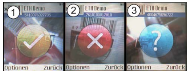
Figure 1. Screen-shots of the Allergy-Check application

simple and fast user interaction is essential, requiring the automated recognition of objects. Even though RFID technology is very promising, the widespread use of RFID tags on supermarket products remains unlikely for at least several years. In contrast, barcodes are already ubiquitous – printed on virtually all consumer items world-wide.