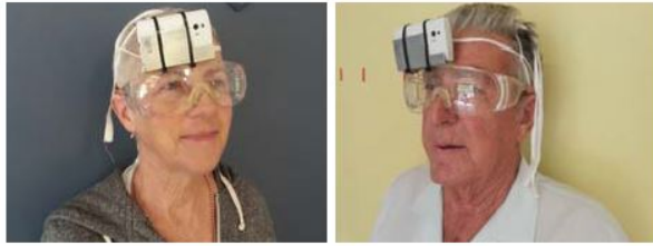
Figure 2: The prototype of a smart glass, used in the research of Zhan et al. [4]

cise by now. Thus, a major concern is physical activity recognition. In this section, a short overview is given about three research papers, which tackle the problem of physical activity recognition through different approaches.