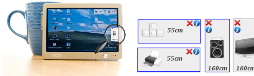
Fig. 1. OQO handheld computer displaying three gateways (left). Gateway widgets for keyboard, printing, sound system and public display. Each gateway is clickable but also has a "hide" button and an "information" button (right).

In our use case, Bob would see a printer gateway on the right of his PDA screen. More information and further options can be accessed by hovering over the gateway or clicking on it. Then he drags-and-drops his file onto the gateway and the printer to his right immediately prints it. The following day he enters the conference room, sees a projector icon on the top of his screen, drags his presentation onto it and it starts fullscreen on the big display. In addition a small window pops up on his PDA with which he can control the presentation.